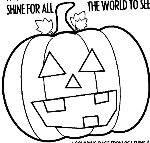
A COLORING PAGE FROM 95.1 SHINE-FM

BEING A CHRISTIAN IS LIKE BEING A PUMPKIN. GOD PICKS YOU FROM THE PATCH, BRINGS YOU IN, AND WASHES ALL THE DIRT OFF OF YOU. THEN HE CUTS THE TOP OFF AND SCOOPS OUT ALL THE YUCKY STUFF. HE REMOVES THE SEEDS OF DOUBT, HATE, AND GREED. THEN HE CARVES YOU A NEW SMILING FACE AND PUTS HIS LIGHT INSIDE OF YOU TO SHINE FOR ALL THE WORLD TO SEE!